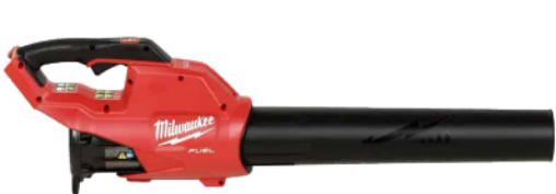
Milwaukee 18 V Blower $149.99