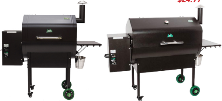
Green Mountain Grills * Daniel DB Boone $499.00 * Jim Bowie $599.00 Free 20 lb. Bag of Lumber Jack Pellets with Purchase