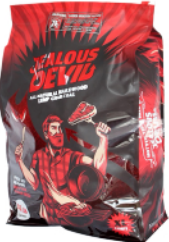
Jealous Devil 20 lb. Lump Coal $24.99