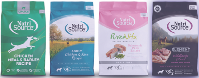
$2.00 OFF any 30 lb. NutriSource Dog Food or $1.00 OFF any 15 lb. NutriSource Dog or Cat Food