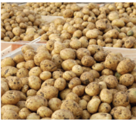
Seed Potatoes $.69/lb. 50 lb. Bags Available