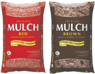
Red Mulch or Brown Mulch 2 Cu. Ft. Bags Your choice: $3.99