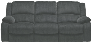
Draycoll Reclining Sofa (was $999.99)