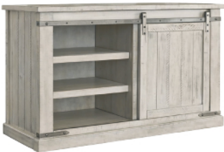
Carynhurst 50" TV Stand (was $556.99) NOW $449.99

25% OFF Regular Priced In-Stock Recliners