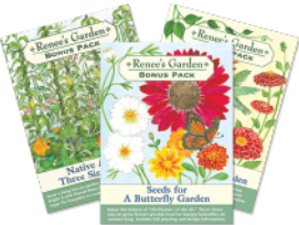
Renee's Garden Seeds starting at $1.99 Heirloom & Gourmet Vegetable, Flower & Herb Seeds