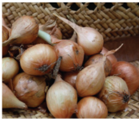
Seed Onions $.89/lb. 50 lb. Bags Available