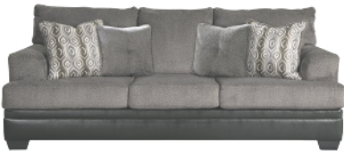
Millingar Stationary Sofa (was $677.99)