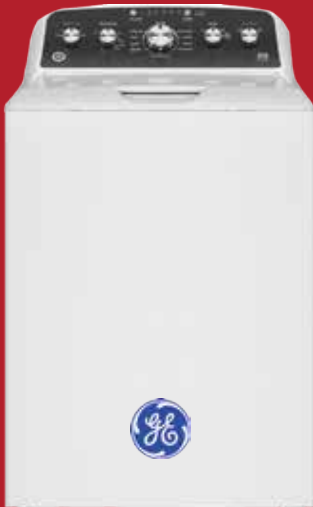
4.7CF TOP LOAD WASHER WHITE SALE $499.99 WAS $799.99