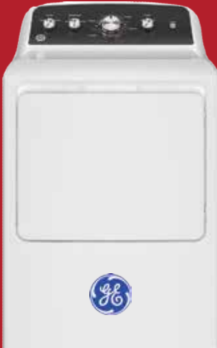
7.0CF ELECTRIC DRYER WHITE SALE $499.99 WAS $799.99