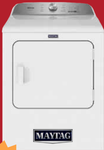
7.0CF PET PRO ELECTRIC DRYER WHITE SALE $699.99 WAS $1,199.99