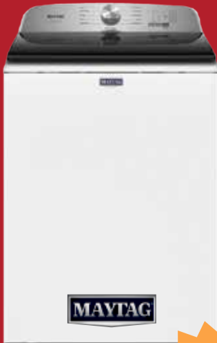
4.7CF PET PRO WASHER WHITE SALE $699.99 WAS $1,199.99