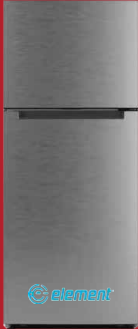
18CF TOP FREEZER REFRIGERATOR STAINLESS STEEL SALE $599.99 WAS $769.99