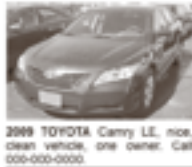
2009 TOYOTA Camry LE, nos. clean vehicle, one owner. Call 555-555-5555.

PLEASE INDICATE NUMBER OF WEEKS TO RUN PAPER CLASSIFIED AD: