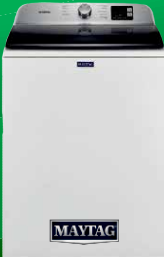
MAYTAG PET PRO TOP LOAD WASHER SALE $699.99 WAS $1199.99