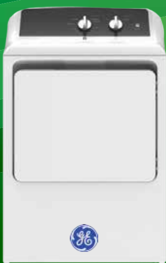
GE COMMERCIAL QUALITY ELECTRIC DRYER 5 YR WARRANTY SALE $849.99 WAS $1099.99