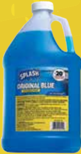
SPLASH WINDSHIELD WASH -20 1 GALLON SALE $2.49 WAS $3.49