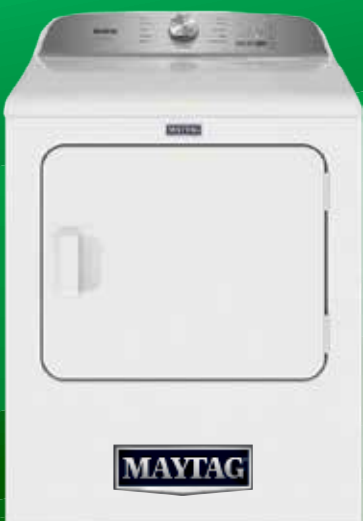
MAYTAG PET PRO ELECTRIC DRYER SALE $699.99 WAS $1199.99