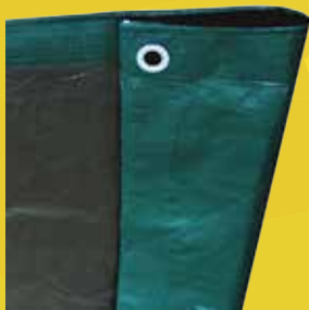
PROBEST TARP HD POLY BROWN/GREEN 6'X8' SALE $3.99 WAS $6.99