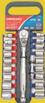
CRESCENT-SOCKET SET 3/8 DRIVE 20PC SALE $34.99 WAS $44.99