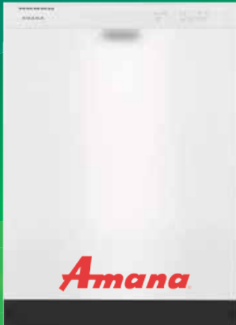
AMANA BUILT IN DISHWASHER SALE $349.99 WAS $499.99