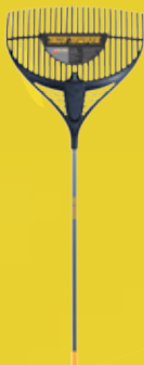
TRU TEMPER LEAF RAKE POLY 26" SALE $21.99 WAS $29.99