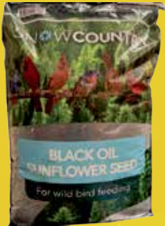
BLACK OIL SUNFLOWER SEED SALE $18.99 WAS $23.99