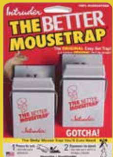
INTRUDER-THE BETTER MOUSETRAP SALE $3.99 WAS $5.99