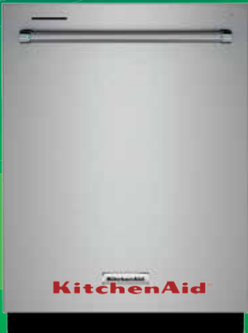
KITCHENAID BUILT IN DISHWASHER SALE $749.99 WAS $1034.99