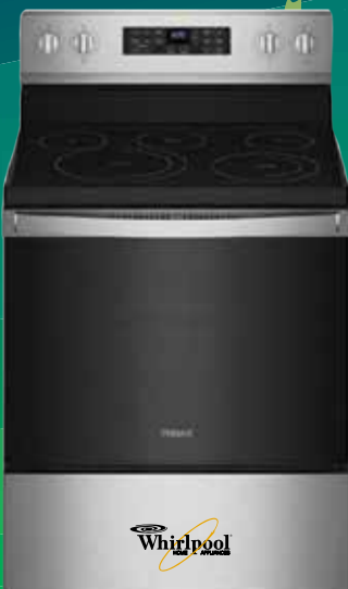
WHIRLPOOL 5.3CF RANGE W/CONVECTION & AIRFRY SALE $899.99 WAS $1299.99