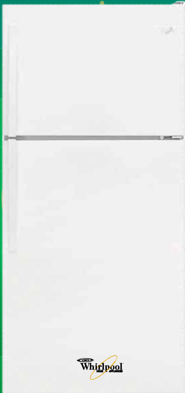
WHIRLPOOL 18CF TOP FREEZER REFRIGERATOR SALE $648.99 WAS $809.99