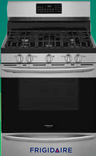
FRIGIDAIRE GAS RANGE W/ CONVECTION AND AIRFRY SALE $999.99 WAS $1549.99