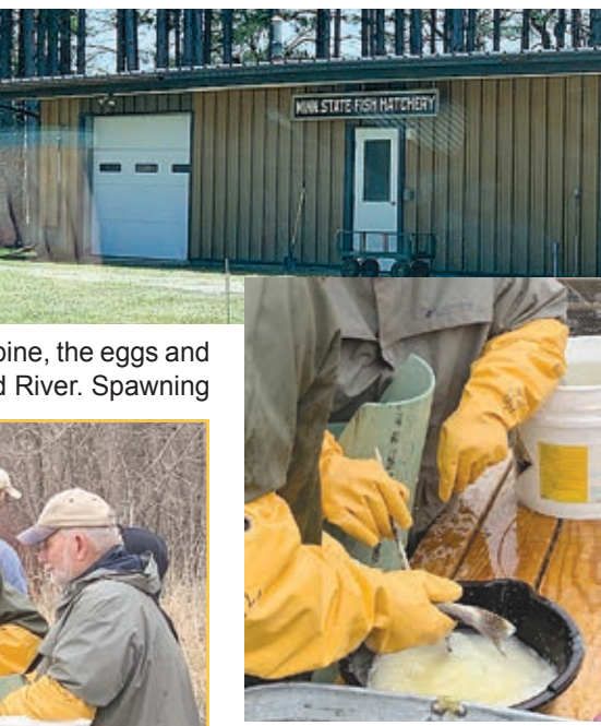
usually ends in three to four weeks. In a typical season, 300-900 guarts of eggs are taken with an average of 135,000 eggs per quart. the Annually, hatcherv

produces 25 to 80 million walleye fry. Walleye fry are stocked into area lakes and rearing ponds. Fry that are stocked in rearing ponds are harvested in the fall as fingerlings and stocked into area lakes