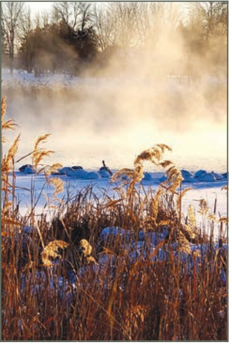
Ottertail River

For most Minnesotans, it is against the law to burn or bury household garbageit's been illegal since the 1980s.