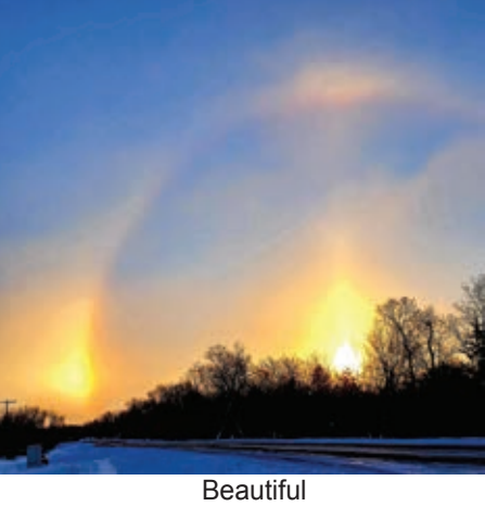
Submitted by Becky Kemling